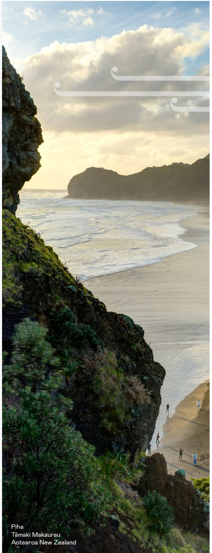
Piha Tāmaki Makaurau Aotearoa New Zealand

*Fidelity Life has an A- (Excellent) financial strength rating from A.M. Best. The rating scale that this rating forms part of is available for inspection at our offices. For more information please visit Fidelity Life's financial strength page .